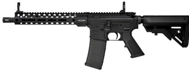
Colt M4 Enhanced Patrol Rifle 5.56 Short Barrel Rifle

Description: Built for the demanding use of those who protect our communities every day, the Colt Enhanced Patrol Rifle (EPR) is the next evolution in the world's most dependable, thoroughly field-tested patrol rifle. Featuring an extended hand guard that accepts modular rail segments for mounting a wide variety of pro-grade optics, lighting, and ergonomics-enhancing accessories