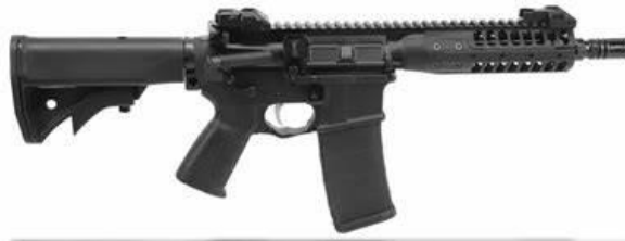
LWRC International, IC-PSD, 5.56

Description: LWRC International IC-PSD semi-automatic short-barreled rifle chambered in 5.56x45mm NATO. This SBR features an 8.5-inch threaded barrel, 1:7" RH rate of twist, 1/2x28" thread pitch, short stroke gas piston, ambidextrous controls, flip up sights, rubber pistol grip, and an adjustable compact LWRC stock.