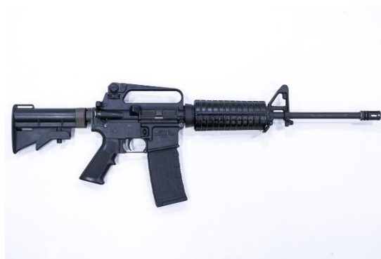
Colt AR-15 A2, 223 Semi-Auto

Description: The Colt AR-15 is a lightweight, magazine-fed, gas-operated semi-automatic rifle. It is a semi-automatic version of the M16 rifle sold for the civilian and law enforcement markets in the United States.