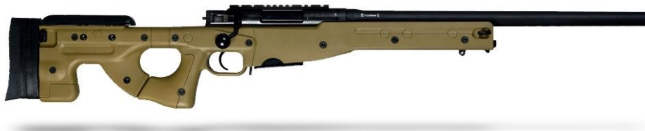
Accuracy International MKIII Bolt Action Rifle

Description: The Accuracy International AX MKIII is a combat-proven sniper rifle designed to meet operational needs around the world. It has been utilized by various military and law enforcement units, including special forces, reconnaissance teams, and counter-terrorism units. The rifle's precision, reliability, and adaptability make it a preferred choice for professionals who require exceptional accuracy in their missions.