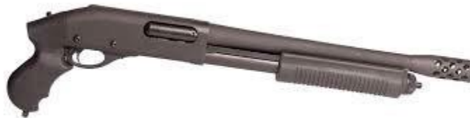
Remington 870 Police Magnum

Description: The Remington 870 Police Magnum pump-action shotgun is a rugged 12-gauge with a short, tactical 18" barrel backed by a stout 3" chamber.