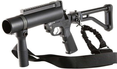
Defense Technology 40mm – Single Shot Launcher

Description: The 40LMTS is a tactical 40mm single shot launcher that features an adjustable Integrated Front Grip (IFG). The Ambidextrous Lateral Sling Mount (LSM) and QD mounting systems allow both a single and two point sling attachment. The 40LMTS will fire standard 40mm Less Lethal ammunition, up to 4.8 inches in cartridge length.