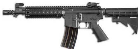
Colt M4 Commando Automatic

Description: The Colt M4 Commando is a modern automatic rifle designed for close-quarters combat in urban environments. It is compact, well-balanced, and ergonomically designed to be highly efficient in the hands of a skilled shooter. Its straight construction improves accuracy, and the low weight of the weapon facilitates aiming and target acquisition.