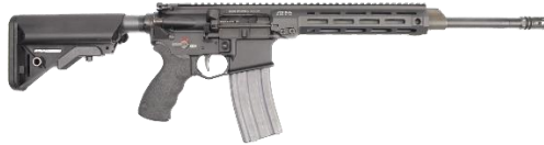
LMT MARS-LA, 5.56 Automatic

Description: This rifle utilizes the patented LMT Monolithic Rail Platform (MRP) upper receiver, the only AR-15 upper that incorporates the handguard and receiver as one component. This state-of-the-art design is CNC machined from a single piece of forged aerospace aluminum resulting in benefits and functionality unmatched in the industry. Integrating this upper receiver with an MRP barrel creates an incredibly simplistic modular platform in which the barrel is held in place with a proprietary locking system utilizing two locking bolts on the right side of the receiver.