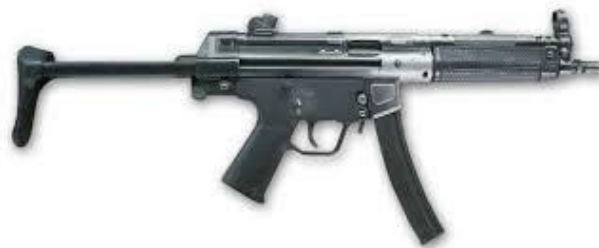
HK MP5 Submachine Gun

Description: Probably the most popular series of submachine guns in the world, it functions according to the proven roller-delayed blowback principle. Tremendously reliable, with maximum safety for the user, easy to handle, modular, extremely accurate and extraordinarily easy to control when firing – HK features that are particularly appreciated by security forces and military users worldwide.