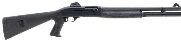
HK Super 90 Benelli, 12 GA, Semi-Auto

Description: When you pull the trigger, the round is fired, and the action remains locked momentarily. As the shot exits the barrel, pressure drops, allowing the bolt to turn and unlock. The carrier assembly then retracts, ejecting the spent shell and loading a new one from the under-barrel magazine. This process happens rapidly, as fast as you can pull the trigger